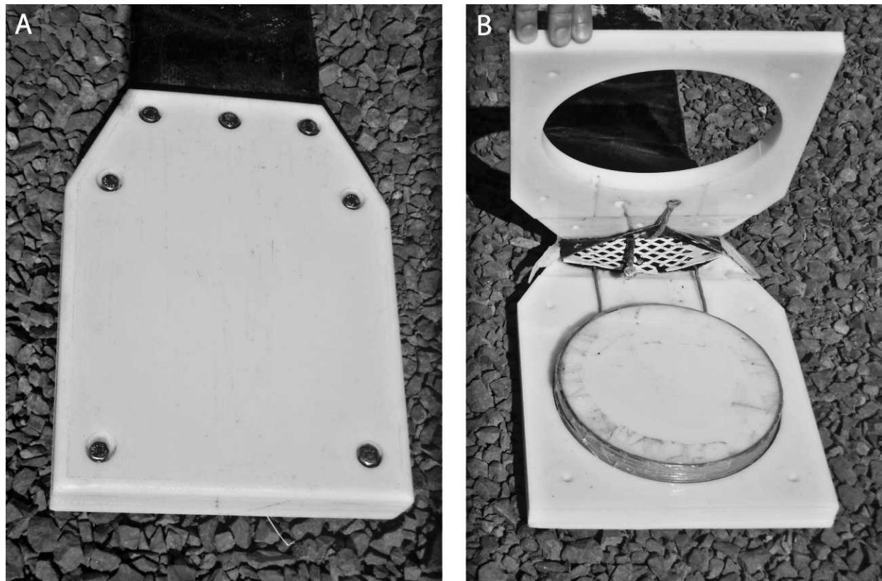
FIG. 2. Photographs of protective housing consisting of 4 high-density polypropylene sheets held to together by stainless-steel bolts (A) and the protective housing interior with exposed antenna coil (B).

continuous wire loop to and from the antenna tuner. The coils were housed in rectangular HDPE encasements (33.0 cm long \times 25.4 cm wide \times 6.4 cm tall) for protection. The encasements consisted of 2 layers of 19.1-mm-thick HDPE between 2 layers of 12.7-mm-thick HDPE (Fig. 2B). Each antenna coil encasement was held together by 7 stainless-steel bolts (5.1 cm long \times 7.9 mm diameter; Fig. 2A). The antenna dropper wires were secured (8.3 cm apart) to polyvinyl chloride (PVC) mesh (15.2 cm wide \times 3.8 m long) by small nylon cable ties. A single 9-mm-diameter Spectra® rope (12 strand) was attached to the PVC mesh between the antenna wires to reduce stress from possible snagging of the antenna coil encasements. Each dropper was encased in a 1.2-kg, vinyl-coated polyester sleeve for protection, while providing flexibility. The PVC mesh, with attached wires, Spectra® rope, and vinyl-coated polyester, was inserted between the 2 pieces of 19.1-mm-thick HDPE on the antenna coil encasement (Fig. 1) and 2 pieces of 19.1-mm-thick HDPE that were 1.2 m long and 15.2 cm wide (boat attachment; Fig. 2A). The boat attachment was held together with 4 stainless-steel eyebolts (7.6 cm long \times 7.9 mm diameter). The final antenna